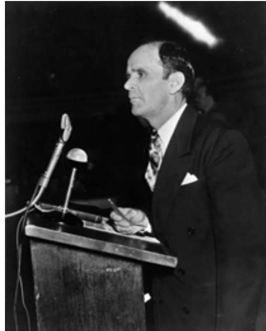
William Marrion Branham

The Pillar of Fire over Brother Branham's head was photographed at Houston, Texas, in January of 1950, and had accompanied him since his birth in 1909. During a 1933 baptismal service in the Ohio River at Jeffersonville, Indiana, this supernatural Being appeared before hundreds of people, saying to him, "As John the Baptist foreran the first coming of Christ, you will forerun His Second Coming."